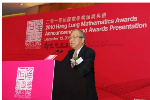
Prof. Shing-Tung Yau (Chair, Scientific Committee)