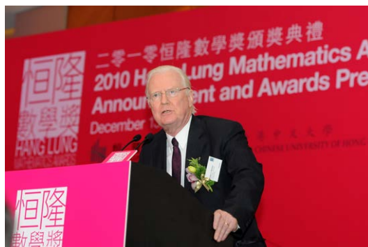
Prof. Sir James A. Mirrlees (Chair, Steering Committee)