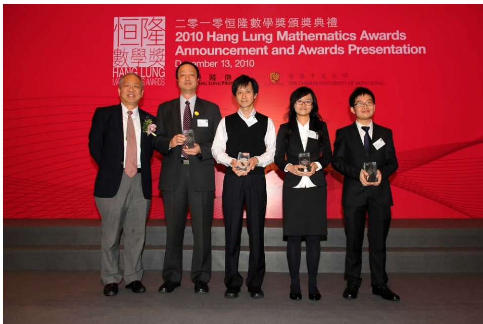
Prof. Shing-Tung Yau (left 1) and the winning team from Po Leung Kuk Centenary Li Shiu Chung Memorial College