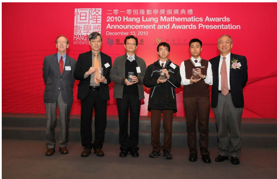
Prof. Gilbert Strang (left 1), Prof. Shing-Tung Yau (right 1), and the winning team from Buddhist Sin Tak College