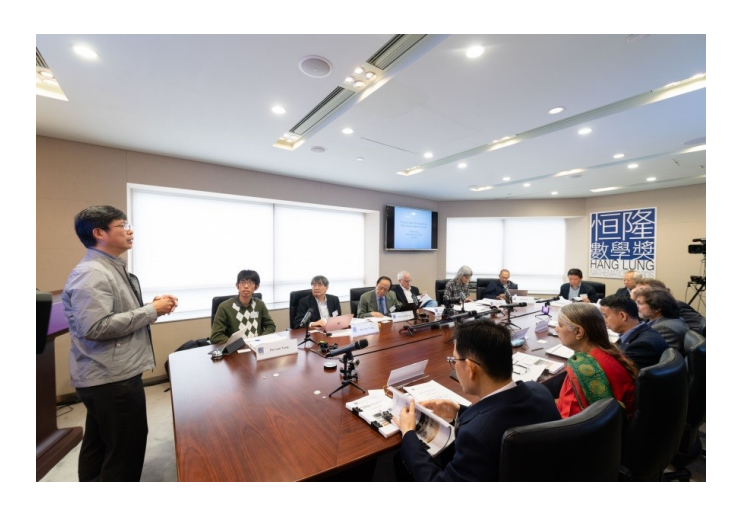
Briefing at the Oral Defense